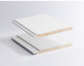
VJ / Shiplap Primed FJ Pine

Specifications Size 140x12mm Cover 133mm Length 2700mm