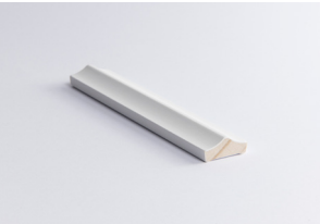
Peak Primed FJ Pine