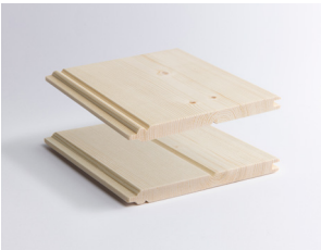
VJ / Regency Spruce