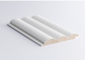
Dune Primed FJ Pine

Specifications Size 91.5x12mm Cover 84mm Length 2700mm