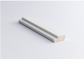
Mesa Primed FJ Pine