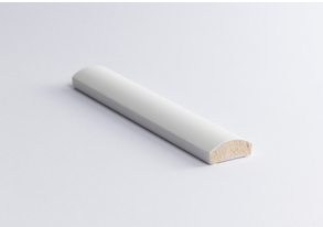
Dune Primed FJ Pine

Specifications Size 28x12mm Length 2700mm