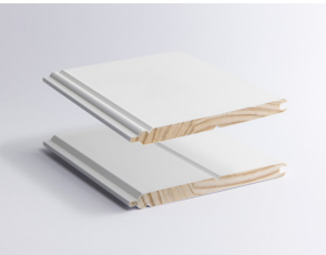
VJ / Regency Primed FJ Pine